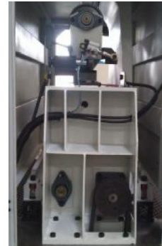
Working unit rear