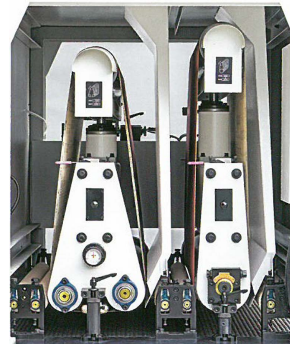
Double Working units