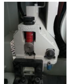
Pressure unit on each side of working unit to secure the working pieces on the conveyor belt

282 Orenda Rd. West, Brampton, ON, L6T 4X6